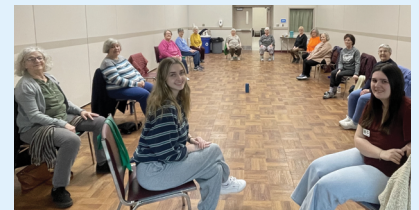
An UpBEAT circle of friends!