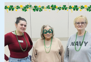
UpBEAT members enjoying St. Patrick's Day!